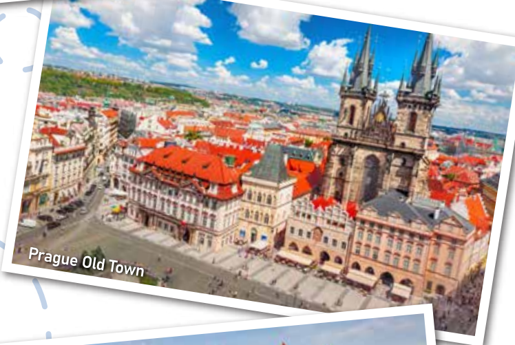
Prague Old Town