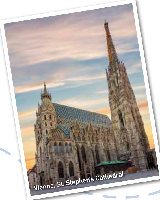
Vienna, St. Stephen's Cathedral