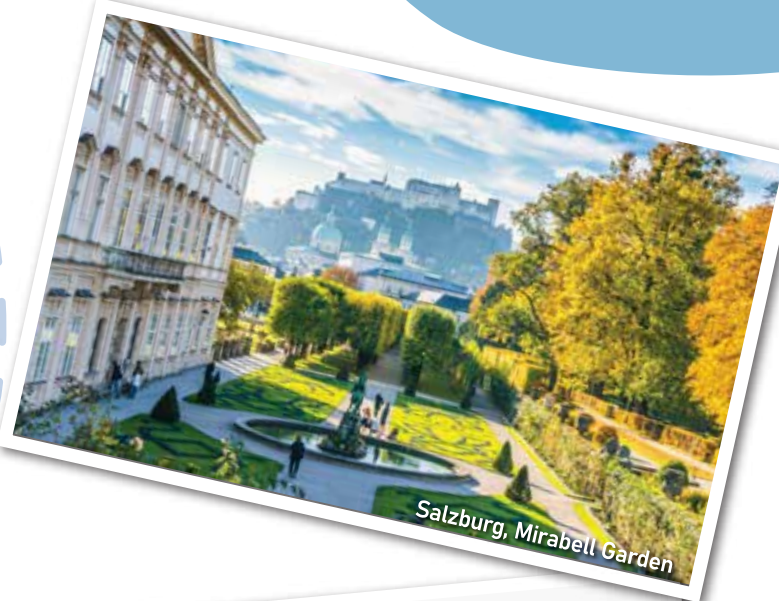
Salzburg, Mirabell Garden