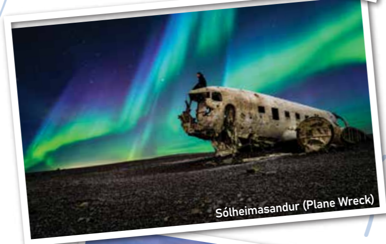
Sólheimasandur (Plane Wreck)