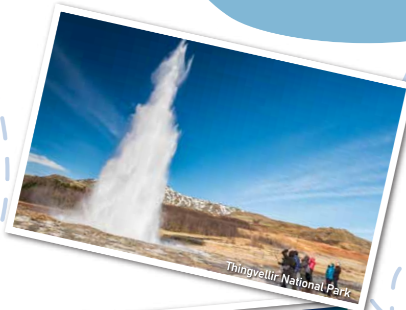
Thingvellir National Park