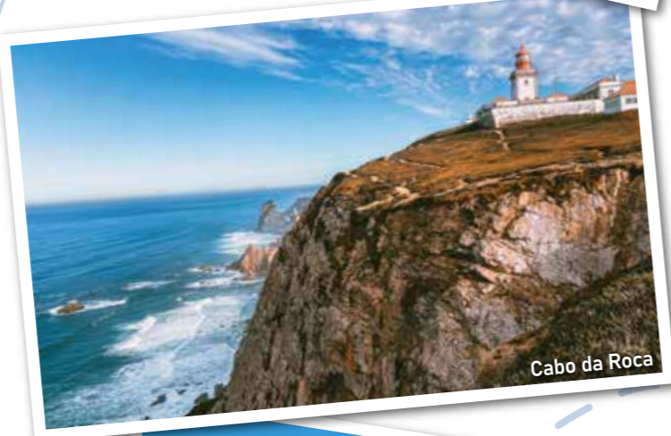
Cabo da Roca