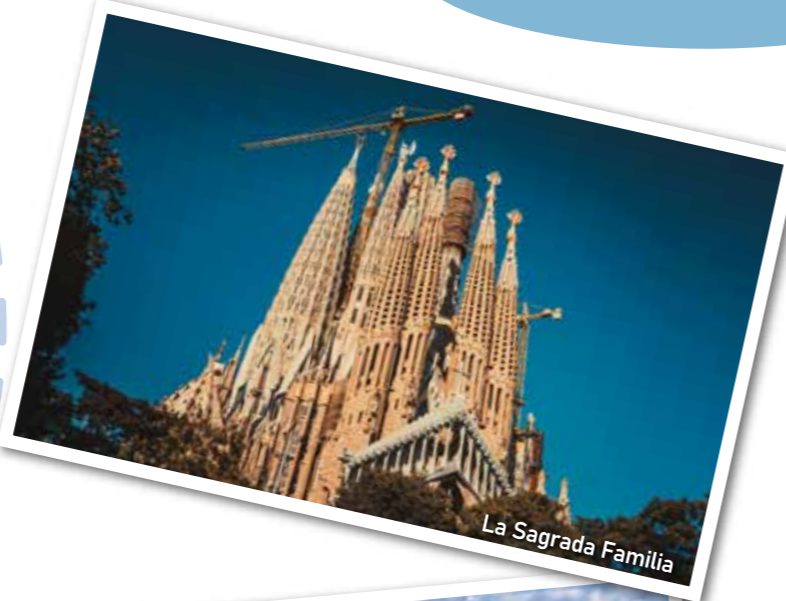
La Sagrada Família