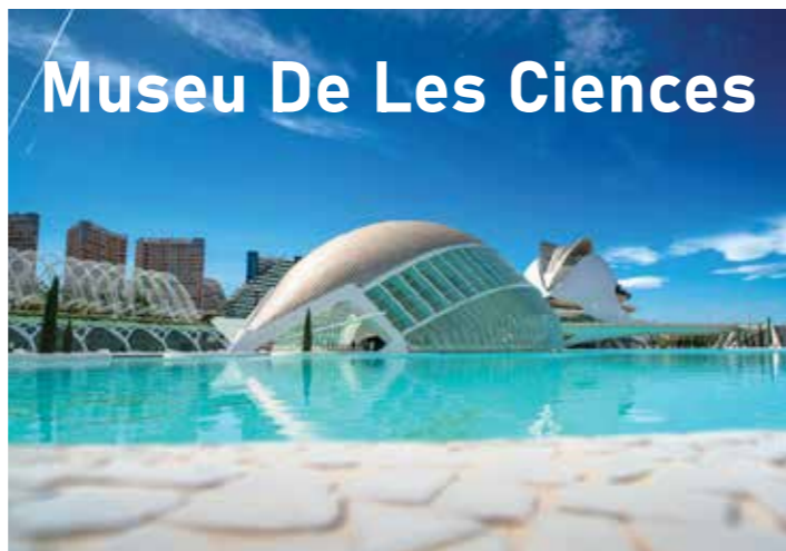
Museu De Les Ciencies

• Plaza Mayor: A historic square that is the centre of social life in the city, surrounded by traditional restaurants and cafes.