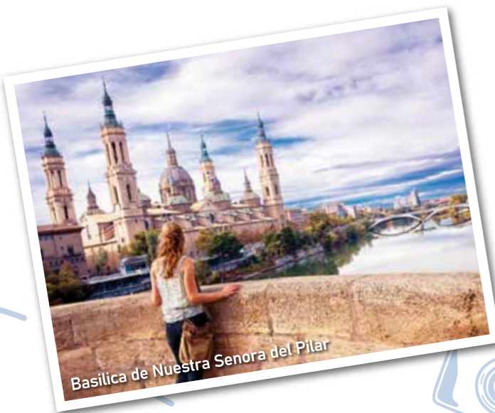
Basilica de Nuestra Señora del Pilar