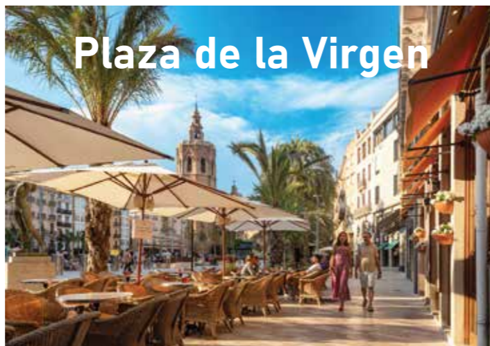
Plaza de la Virgen

• Playa de La Concha – Frequently ranked as one of the most beautiful beaches in Europe, this golden sandy beach offers a spectacular shell-shaped bay.