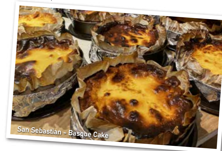
San Sebastian - Basque Cake

> Parte Vieja (Old Town) – Stroll through its narrow streets, rich in history and Basque culture, and try the famous Basque cake.